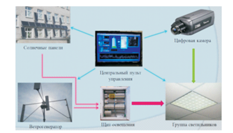
Fig. 3. Block diagram of the demonstration and laboratory complex of the intelligent artificial lighting systems and alternative energy

This R&D was designed to solve energy saving issues and to assure comfort. Street heliostats (see Fig. 1) direct sunlight into the room, where the mirrored wall with moving mirrors (see Fig. 2) redistributes the light inside the room and the intelligent artificial lighting system (see Fig. 3) switches on all necessary lamps using the results of video processing and neural network algorithm.